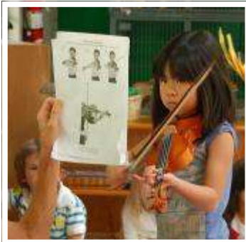
Parent-Child Night, students' favorite night of the year.