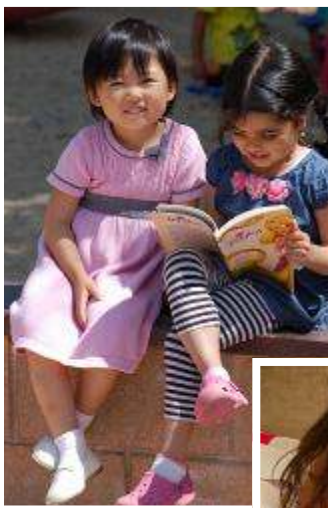
Scenes from a Primary classroom.

Each year MIR's graduating students visit a location that is both fun and educational. Students select the location, plan the trip, and raise the funds to go. The trip falls under the heading of "Practical Life," helping them build life skills and independence in addition to an appreciation of our history and culture. For a complete travelogue of the trip, visit facebook.com/montessoriinredlands .