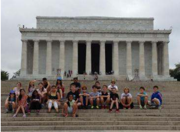
MIR 6th year students on the steps of the Lincoln Memorial in Washington, D.C.