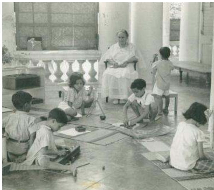
Dr. Maria Montessori observes her students in India.